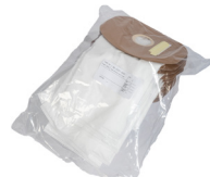
Microfibre vacuum bags