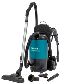
Valet Battery Backpack