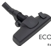
ECO floor tool