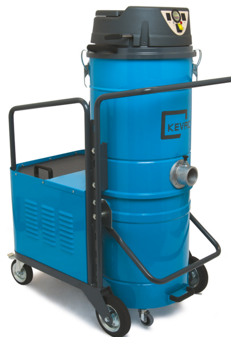
Batteries available room size (mm)

8) Other materials available according to the material to be vacuumed