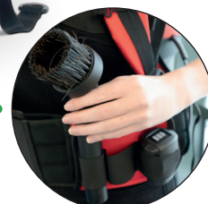
Waistbelt tool storage