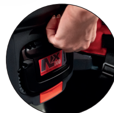
Easy battery change