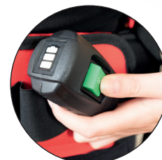
Integrated hand control